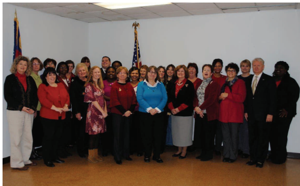
Pictured left: Albemarle Commission Staff