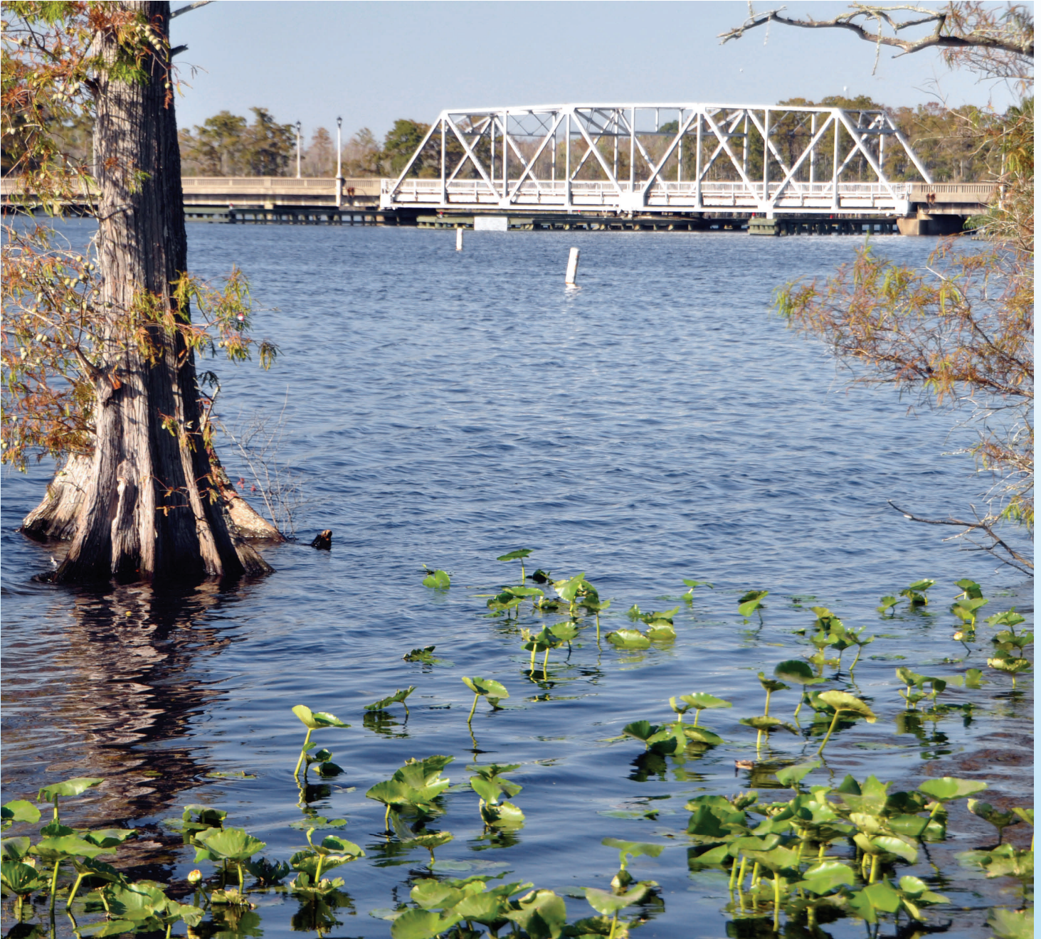
Famous S-Bridge in Perquimans County